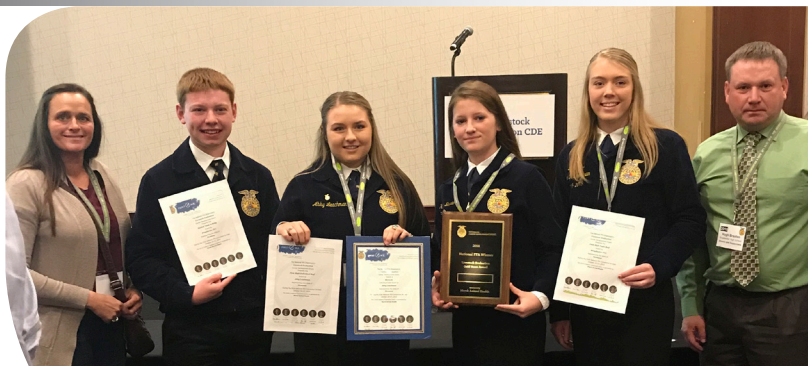
Montana 3rd Place Livestock Judging Team at National FFA Convention